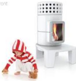
RoundStack | Front